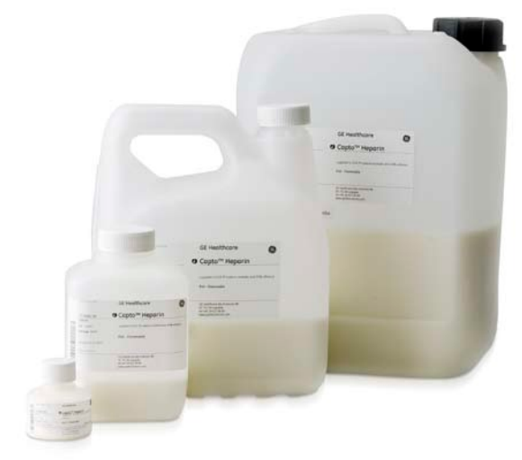
Fig 1. Capto Heparin, which purifies proteins with an affinity for heparin, is available in laboratory and process-scale quantities.

Capto Heparin is based on highly-rigid spherical agarose particles. Agarose is a natural polymer whose hydrophilic properties minimize structural changes of the target molecule and non-specific adsorption to the matrix. The rigid base matrix offers outstanding pressure and flow properties (Fig 3), which are key attributes for cost-effective, large-scale use. Capto Heparin permits a wide working range of flow velocities, bed heights, and sample viscosities, all of which have a positive impact on processing costs. Table 1 lists key characteristics of Capto Heparin.